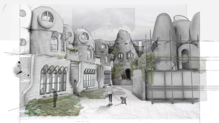
Living a 'WildLife' (2020) - View within the Enclave

-Award by 'The Cities of London & Westminster Society of Architects' for comprehensive design proposal amongst university batch